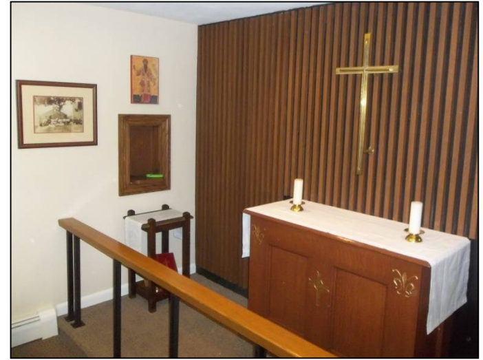
St. Cyril's Chapel